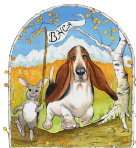
Basset Hound Club of America National Specialty • Denver 2019